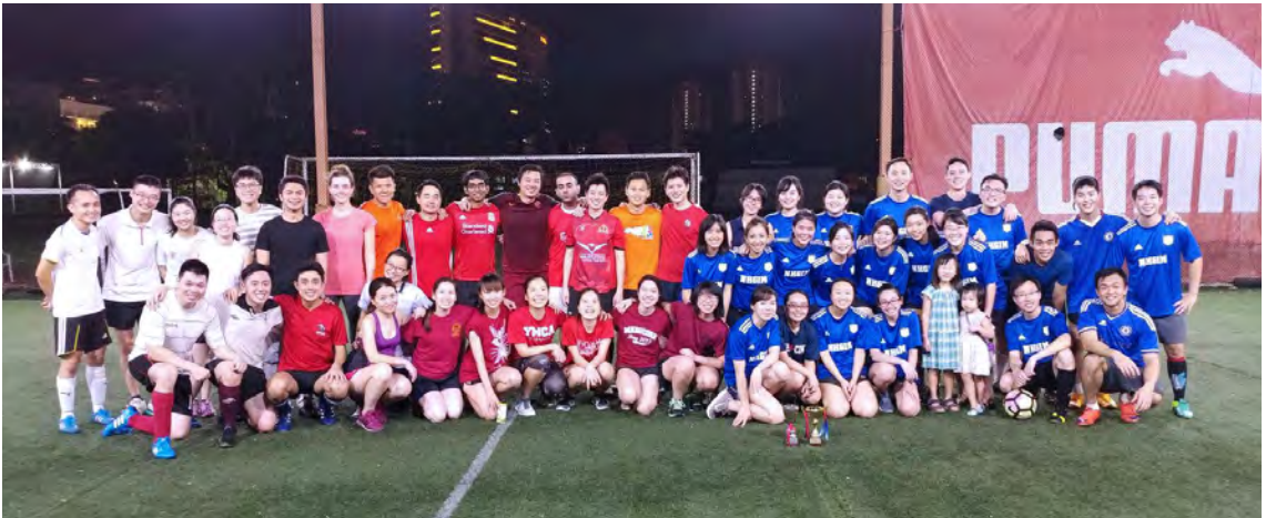
The NHG IM Residency team (in blue), with the other IM Residency teams from NUHS and SHS.

It was a quiet Friday evening as we made our way after work to Stadio Futsal, not knowing what to expect, but up for some good fun and games, as well as the opportunity to make some new friends.