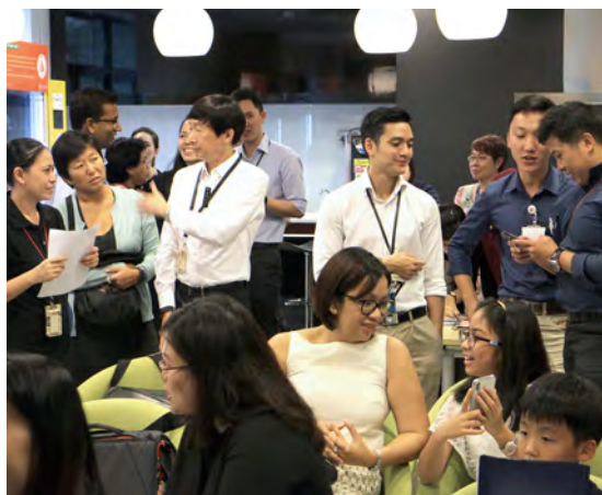
Some 50-strong crowd attended the 2017 NUS Dean's Appreciation

national average. And based on the student feedback received, the students indicated that they were overall satisfied with the quality of medical education received, with 89 per cent rating TTSH as 'excellent' or 'good'.